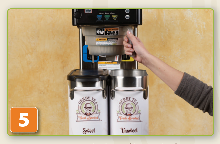
UNSWEET TEA Turn the brew filter to the far RIGHT before brewing.

1 PACKET = HALF BREW 2 PACKETS = FULL BREW