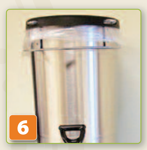
Pull liner over the edges of the tea urn, making sure the opening to the tube is not obstructed