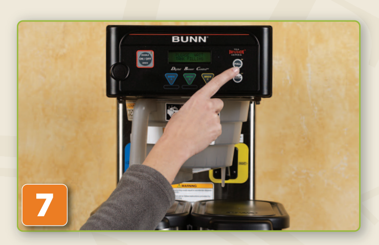
To brew a Full Brew (3 gallons) press the FULL Brew Button