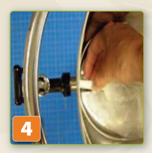
Place the liner in the urn and feed the white tube through the opening in the urn and through the faucet