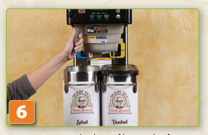
SWEET TEA Turn the brew filter to the far LEFT before brewing.