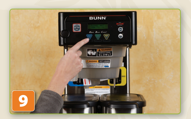
BREWING SWEET TEA Press the Blue "A" button on the left and the brewing will begin.