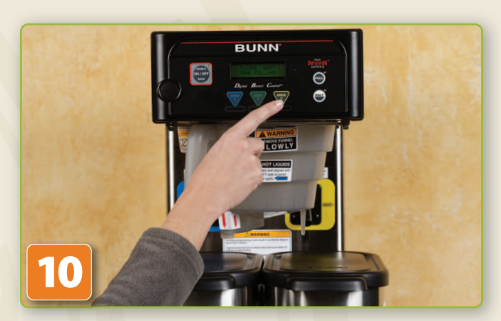
BREWING UNSWEET TEA Press the Yellow "C" button on the right and the brewing will begin.

Following the brew will be a countdown of drip time. The message DRIPPING will appear on the screen, showing the time remaining until the tea no longer drips from the funnel tip.