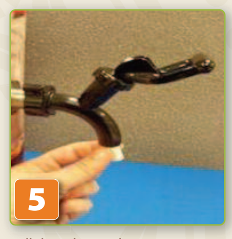
Pull the tube until it is snug