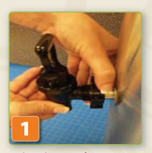
Unthread existing faucet