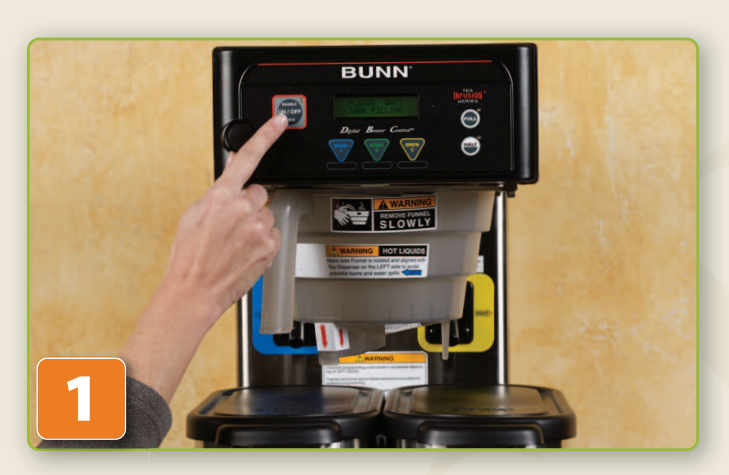
Press the ON/OFF button to turn the brewer on. The yellow light on the top right corner will illuminate when the brewer is on.