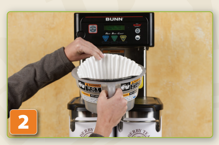
Insert the tea filter into the brew funnel.