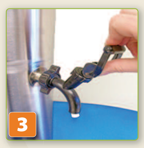
Move faucet to the open position