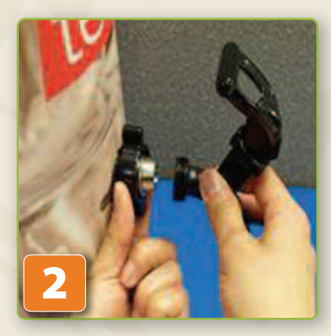
Install the new faucet by securing the thread