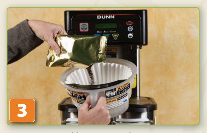
Pour the packet of fresh loose leaf Derby Tea into the filter. Level the bed of tea leaves by gently shaking.