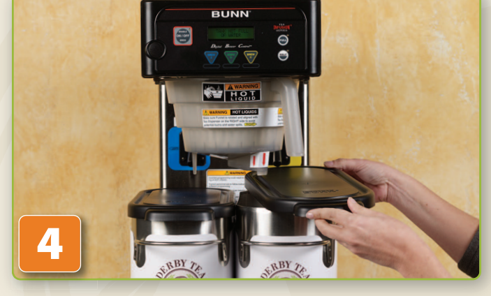
Slide the funnel into the funnel rails until it stops. Remove the urn lid before brewing.

1 PACKET = HALF BREW 2 PACKETS = FULL BREW