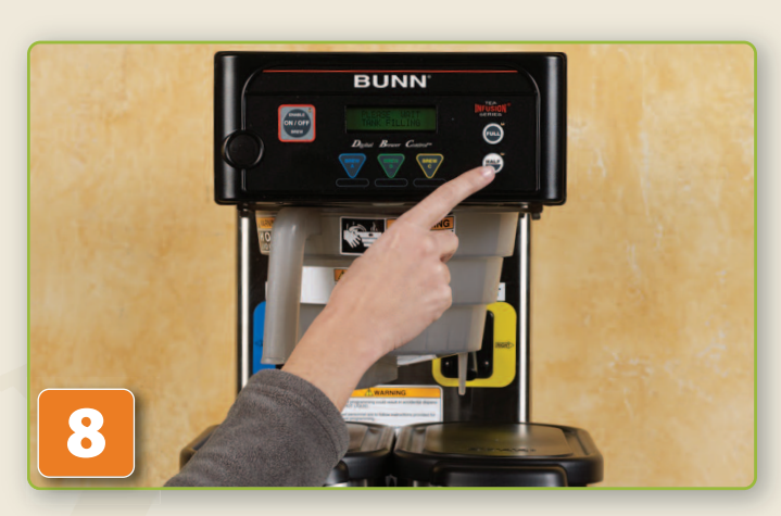
To brew a Half Brew (1.5 gallons) press the HALF Brew Button